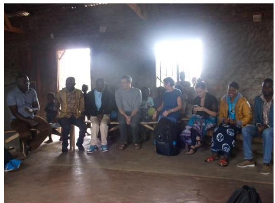
Meeting with staff in St James' Church Morrumbala, Zambezia, September 2018

The project's aim is for the church to transform communities by spearheading development initiatives such as communal farms or health and education infrastructure.