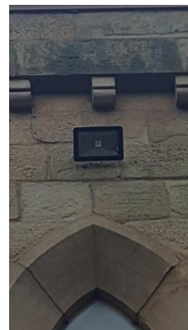
View of existing light in the middle of the north wall of the church