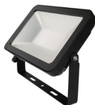
Proposed light similar to this

These 2 additional lights will provide sufficient light to light the path for pedestrians and cars without any glare. We already have similar lights installed on the south side of the church.